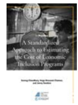
A Standardized Approach to Estimating the Cost of Economic Inclusion Programs (November 2022)

Enhancing Links of Poor Farmers to Markets: A Practice Review for Economic Inclusion in Zambia (September 2022)