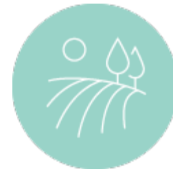
CLIMATE RESILIENCE SUPPORT