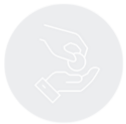
WAGE EMPLOYMENT FACILITATION