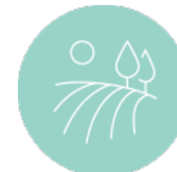
CLIMATE RESILIENCE SUPPORT