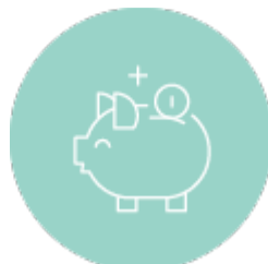
FINANCIAL SERVICES FACILITATION