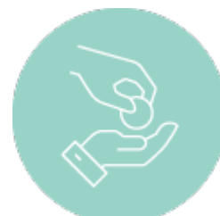
WAGE EMPLOYMENT FACILITATION